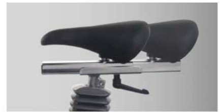
Horizontal saddle adjustment