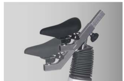
Saddle adjustment for child ergometry