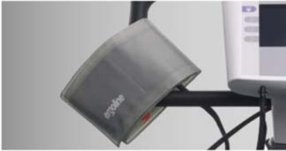
Automatic blood-pressure measurement