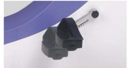
Adjustable foot pedal length