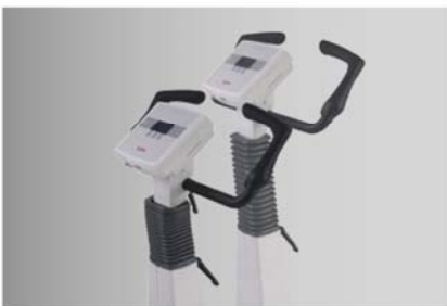
Variable handlebar height adjustment