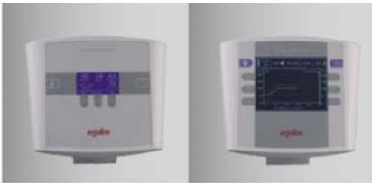
Different operating units (P and K)